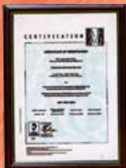
ISO 14001:2004 Certificate No. A21 ENV 715