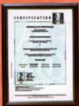
ISO 9001:2000 Certificate No. A21 7812