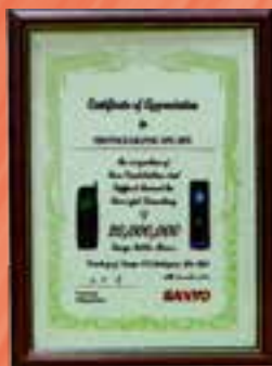
Certificate of Appreciation